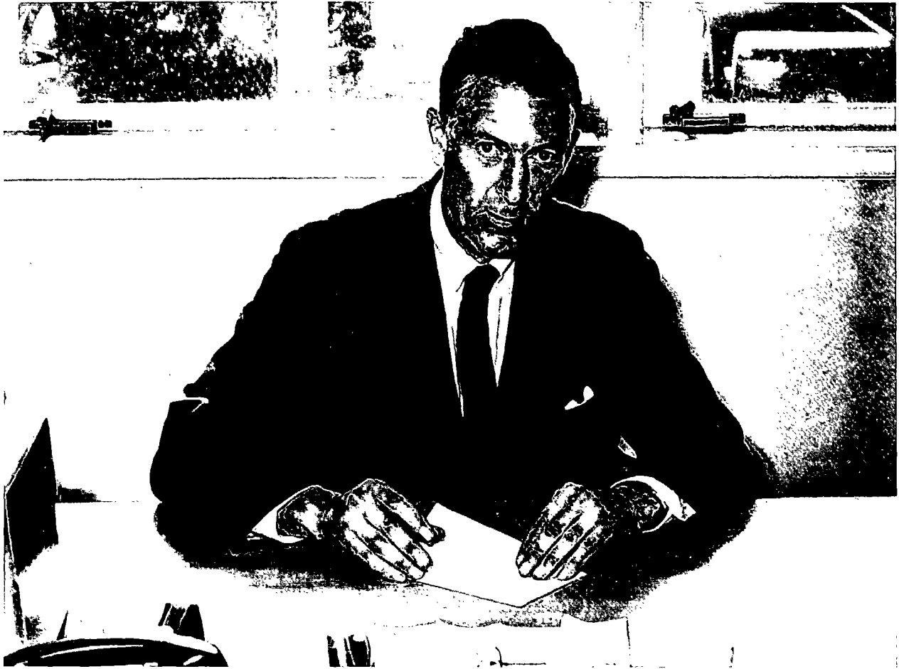
Robert E. Fulton, inventor of Skyhook.

1952, a CAT C-47 with CIA officers John T. Downey and Richard G. Fecteau departed Seoul for Kirin Province, intending to pick up members of a team that had been inserted the previous July.